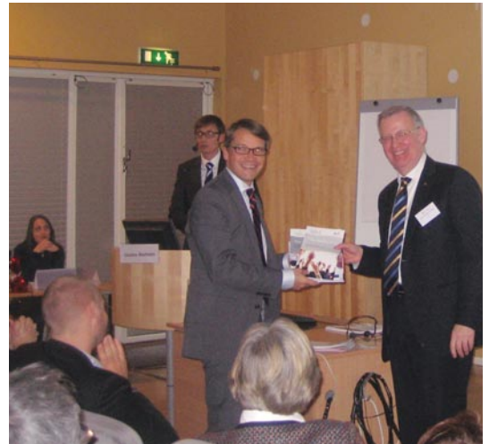
EPF President Anders Olauson and Swedish Minister for Health and Social Affairs, Göran Hägglund, Value+ Conference December 2009

EPF has been very much engaged in the review of the EU Recommendation and in the development of a Roadmap on interoperability meant to pave the path for the deployment of eHealth interoperable solutions across the EU.