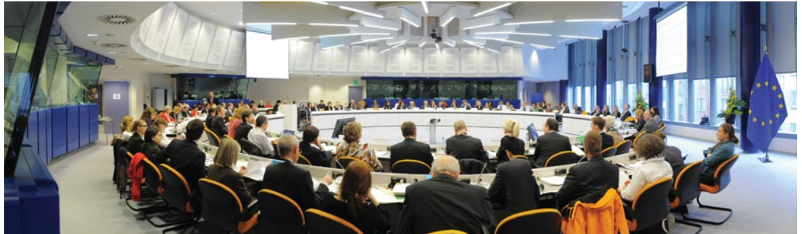
The Pharmaceutical Forum Final Conference, March 2009

As a direct result of the Value+ project on meaningful patient involvement a much greater understanding and commitment to patient involvement in research projects has been achieved within the European Commission which EPF will continue to develop in 2010.