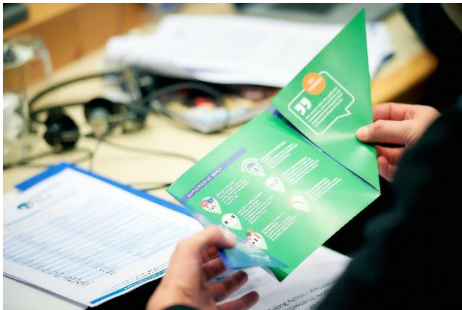
EPF in a nutshell. AGM delegate reviewing our new brochure

With this vision in mind, EPF strives to eliminate disparities and barriers related to access and address standards of care and health inequalities within the EU.