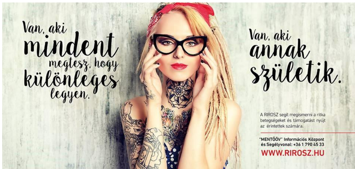
The communications campaign on rare diseases by HUFERDIS, the Hungarian Federation of Rare and Congenital Diseases.

The module proved to be highly useful for all the participating organisations, who highlighted the importance and value of being able to share experiences with fellow patient organisations.