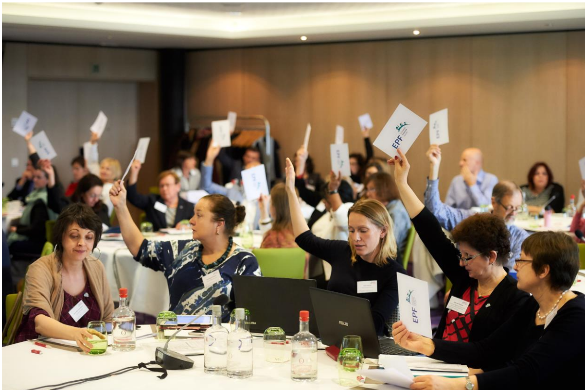
Members voting at EPF AGM 2017

In 2017, the EPF family was delighted to welcome seven new members :