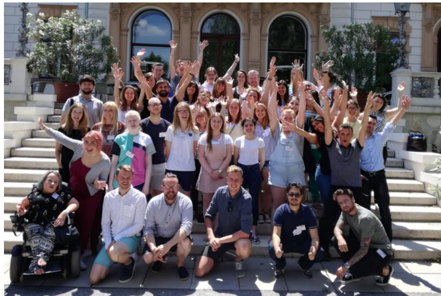
The participants to the Summer Training Course for Young Patient Advocates in Vienna.

The first edition of this newly branded EPF programme was a success and helped to strengthen the bonds within this very unique, motivated, and inspiring community of young patient advocates.