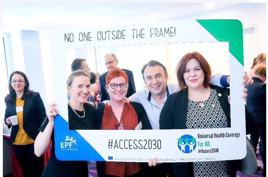
Supporters of our campaign at the AGM

Advocating for health in all policies: developed a Statement on the 2017 country specific recommendations on health and long-term care and the European Semester Process.