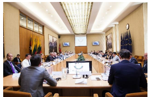
Country stakeholder meetings in Romania (top), Lithuania (middle) and “State of the EU” event at the European Parliament (bottom).